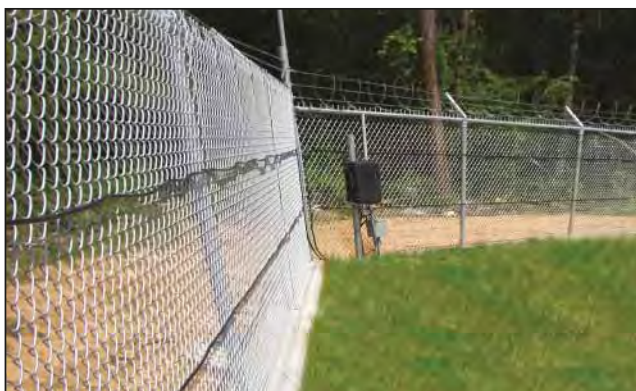
Border Security Monitoring