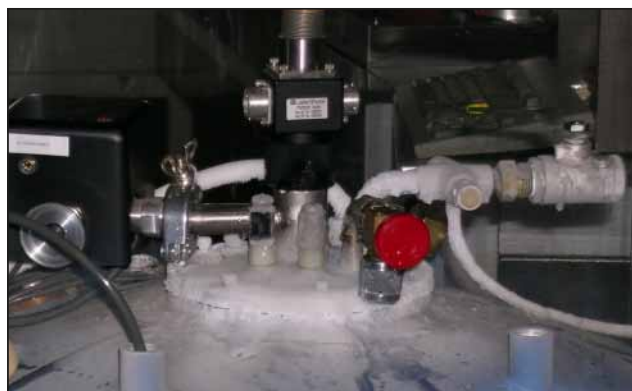
Cryostat Temperature Sensing