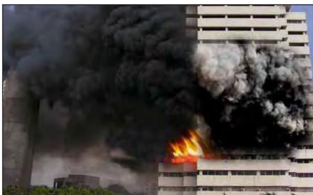
Building Fire Detection