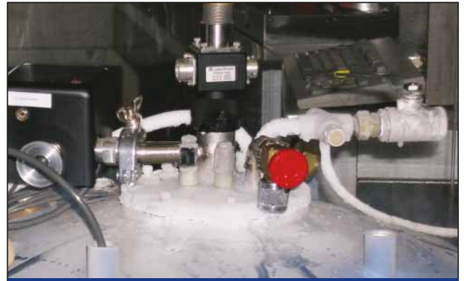
Cryostat Temperature Sensing