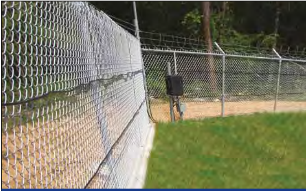
Border Security Monitoring