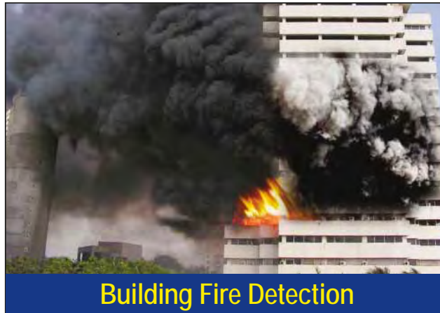
Building Fire Detection